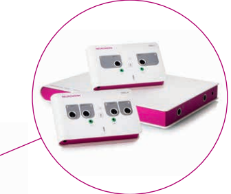
Stimulator unit and EMG amplifier with 2 or 4 channels