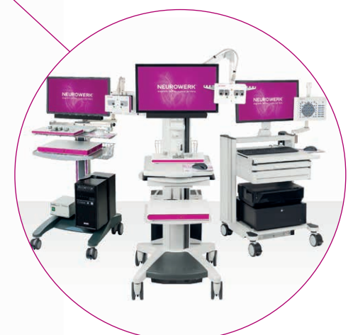
Customised solutions for support arms, carts and accessories

NEUROWERK CENTER is the foundation of our NEUROWERK EMG and EEG systems. Thanks to a powerful SQL database, NEUROWERK CENTER provides easy access to all aspects of our systems. Users can manage and save all examination results, both EMG and EEG, over the long term. It has never been easier to share test results, reports and findings via an HL7 or GDT interface, or to export them as PDF documents. Data is protected from unauthorized access by integrated user management functions.